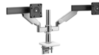
Humanscale Arm for dual monitor configuration, polished aluminum with whit... 4ZE1U10767