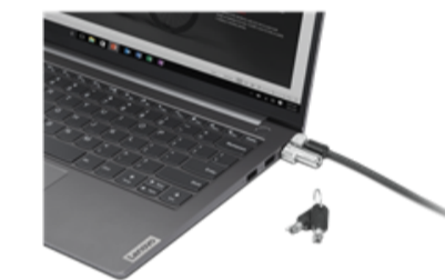
NanoSaver Cable Lock from Lenovo 4XE1L51710