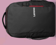
Lenovo 15.6 Laptop Everyday Backpack B510-ROW 4X4IU80414