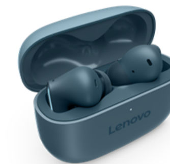
Lenovo TWS YOGA PC Edition - Tidal Teal