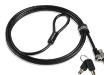
Kensington MicroSaver DS 2.0 Cable Lock from Lenovo